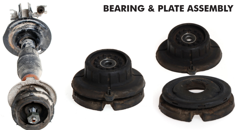
Line up (without spring)